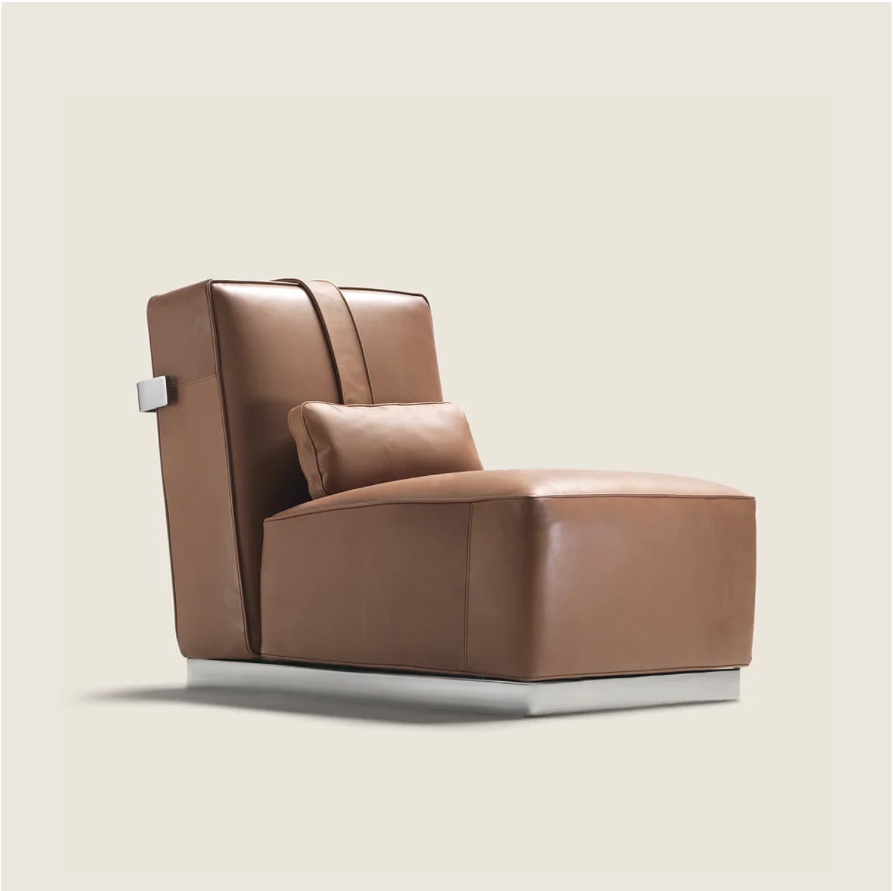
A.B.C.D. ANTONIO CITTERIO 2014 ARMCHAIRS