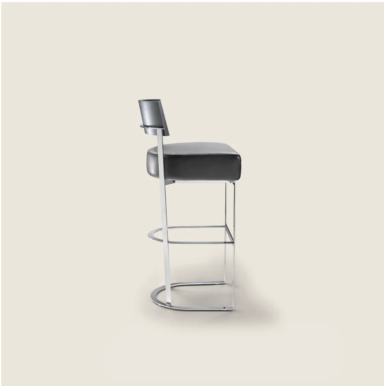
MORGAN ANTONIO CITTERIO 2002 STOOLS