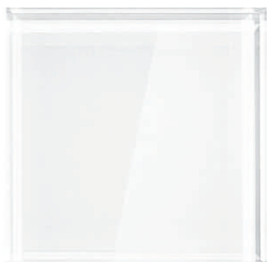
vetro extralight extralight glass