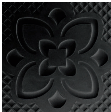
vetro extralight retroverniciato Nero Brillante back-painted extralight glass, Brilliant Black finish