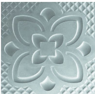
vetro extralight extralight glass