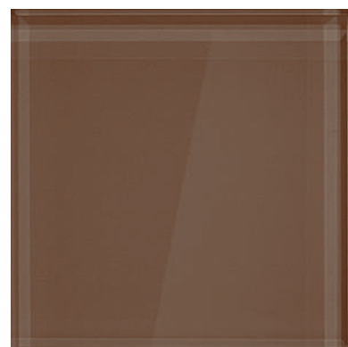
vetro bronzo bronze glass