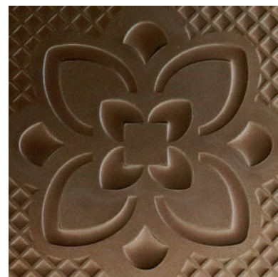
vetro extralight retroverniciato Marrone Brillante back-painted extralight glass, Brilliant Brown finish