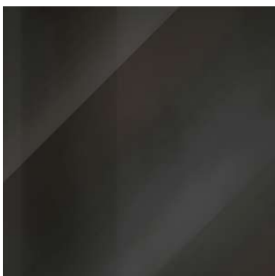
Nichel Nero Lucido Black Glossy Nickel