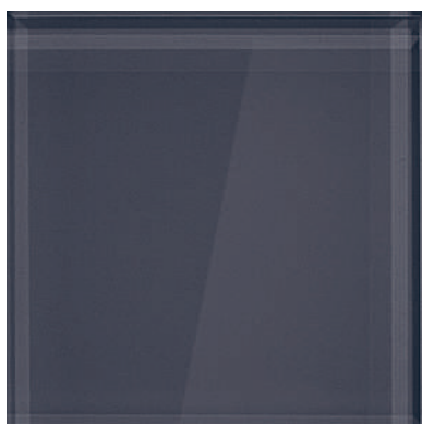
vetro fumé smoked glass