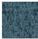
DE sky blue