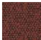
DM brick red