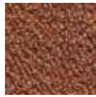
4/04/O4 rusty orange