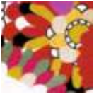
QQ vevey red tones