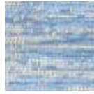
3 sky blue