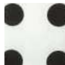
PB white pattern