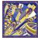
NY New York