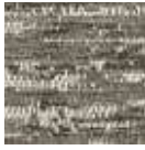
2 dove grey