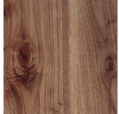
noce canaletto canaletto walnut