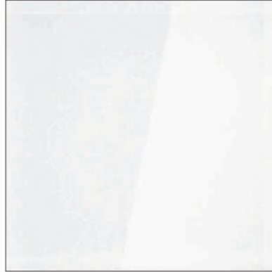
vetro extralight extralight glass