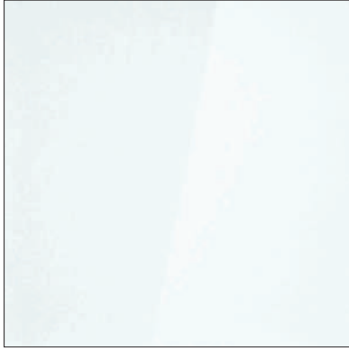
vetro trasparente transparent glass