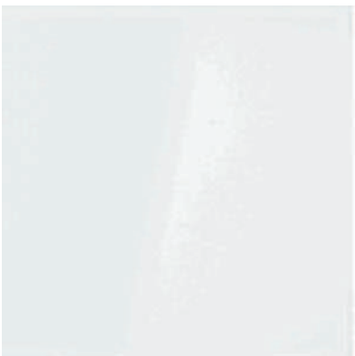
Vetro extralight acidato retroverniciato bianco White back-painted acid-etched extralight glass