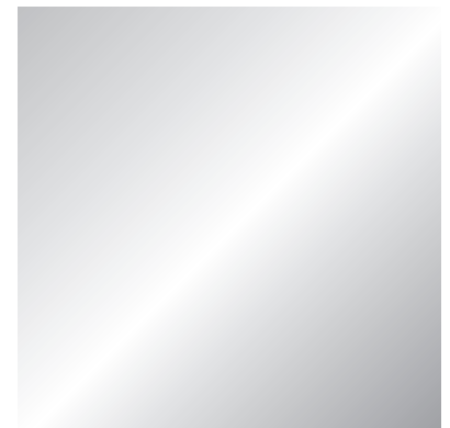
vetro extralight retroargentato back-silvered extralight glass