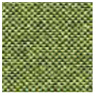
S/SS acid green