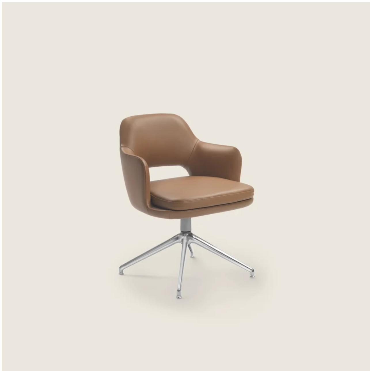
ELISEO ANTONIO CITTERIO 2022 DINING CHAIRS/CHAIRS