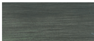
metallo brunito spazzolato a mano hand-finished burnished metal