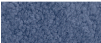
montone avio avio mouton