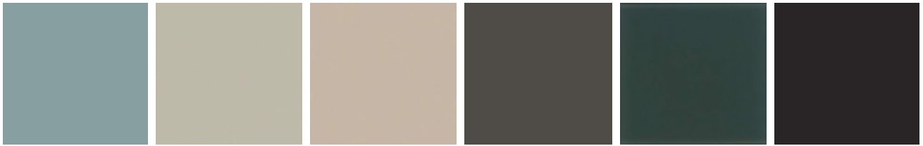
Satin cadet blue