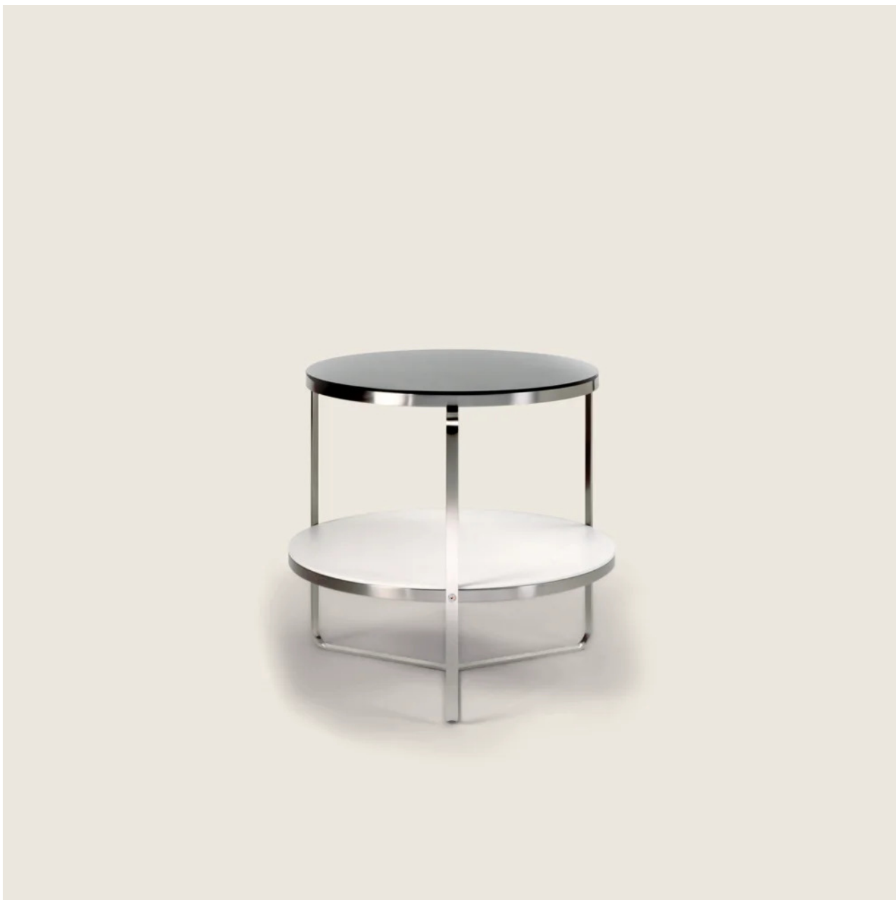
CARLOTTA ANTONIO CITTERIO 1996 COFFEE AND SIDE TABLES